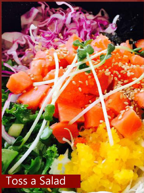
Toss a Salad