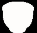
6.5L SS304 Bowl